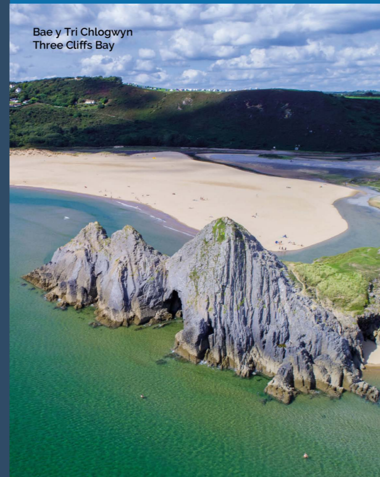
Bae y Tri Chlogwyn Three Cliffs Bay

Gallwch ail-lenwi eich potel ddŵr yn ystod eich taith. Lawrlwythwch ap Refill i ddod o hyd i'ch Gorsaf Ail-lenwi leol, gan gael dŵr yfed ffres yn ystod eich taith. refill.org.uk