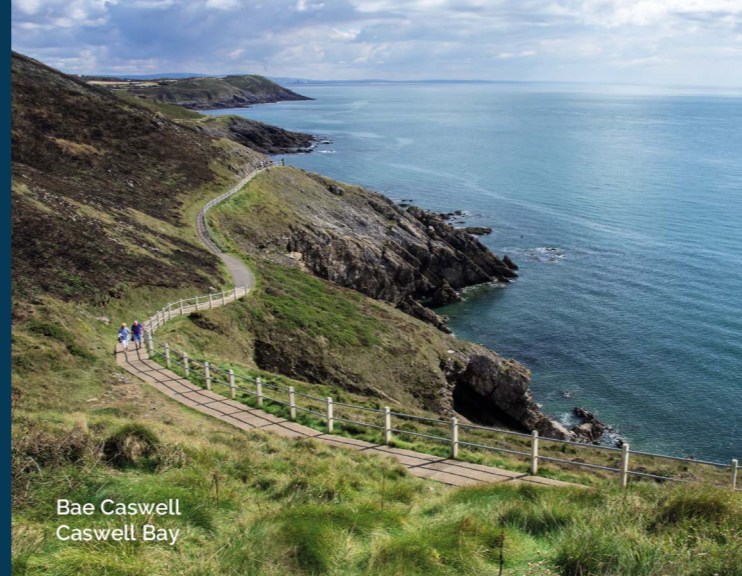
Bae Caswell Caswell Bay