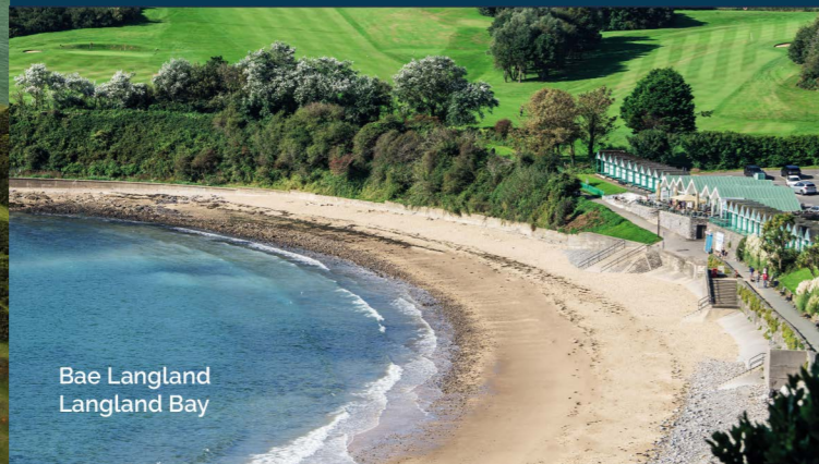
Bae Langland Langland Bay

Mae dwy filltir o bromenâd gwastad ar lan y môr, ynghyd â thraeth tywodlyd eang a golygfeydd gwych dros Fae Abertawe tua Phenrhyn Gŵyr. Mae Traeth Aberafan yn lle delfrydol i wylio'r haul yn machlud.