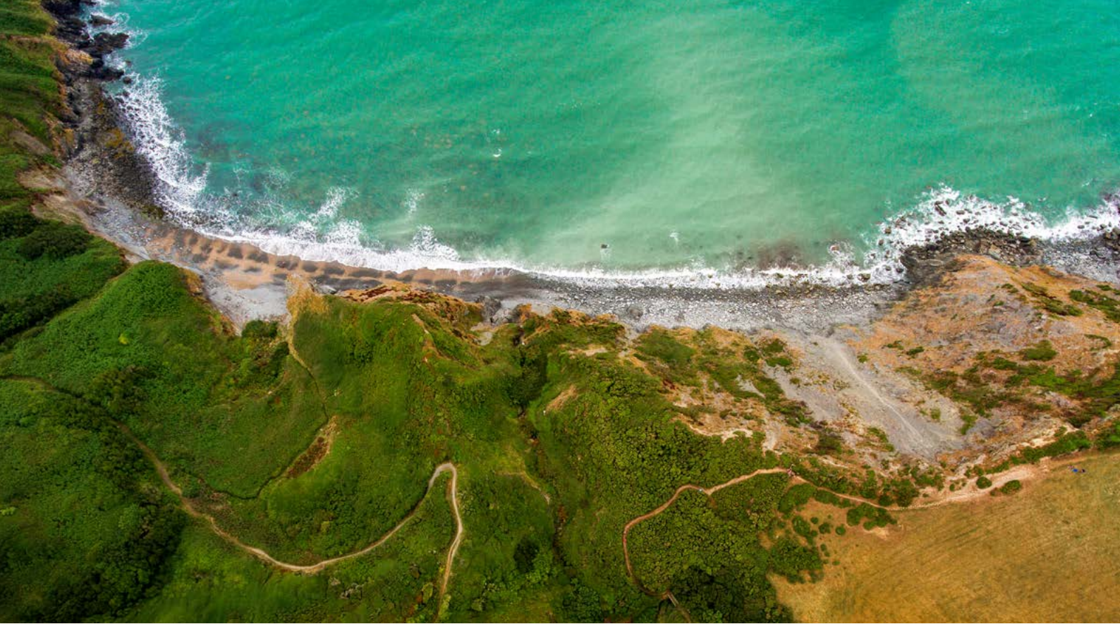
New Quay and Cwmtedu, Ceredigion