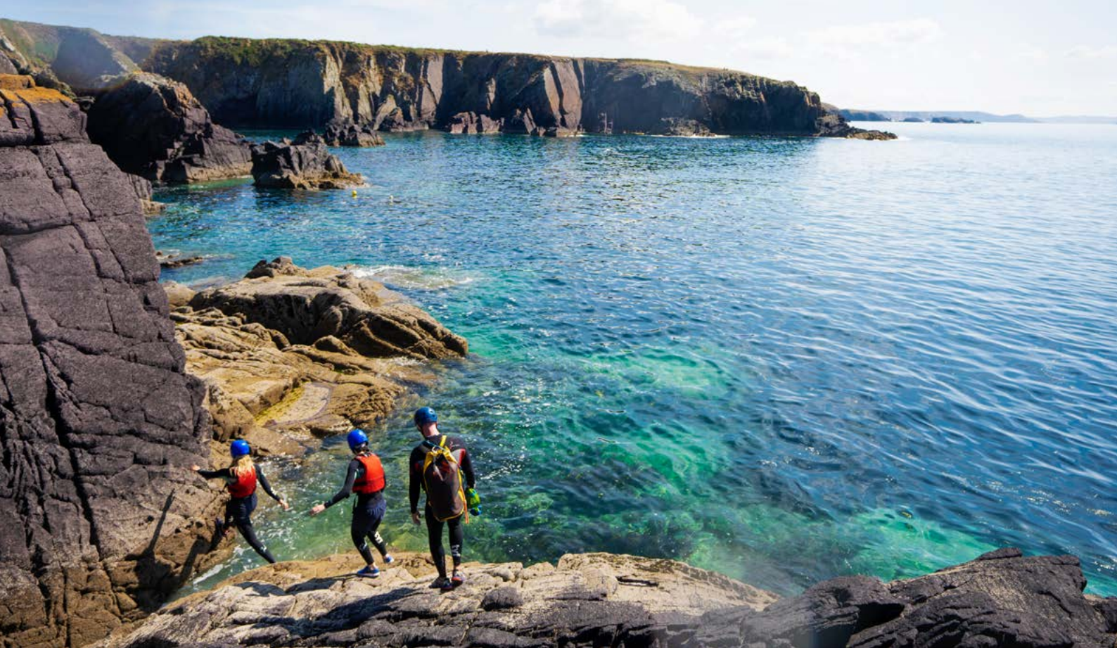
Coasteering, Porthclais Harbour, St Nons Bay, Pembrokeshire