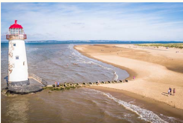
Point of Ayr Lighthouse, Talacre

Five things to do in St Davids | Visit Wales Welcome | St Davids Cathedral St Davids Bishop's Palace | Cadw