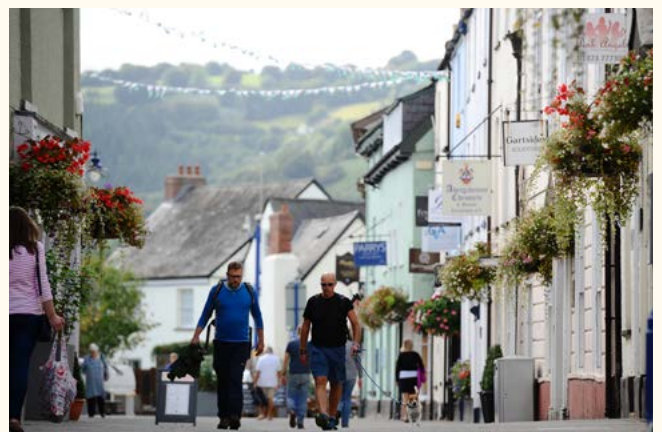
Abergavenny Town Centre, Monmouthshire