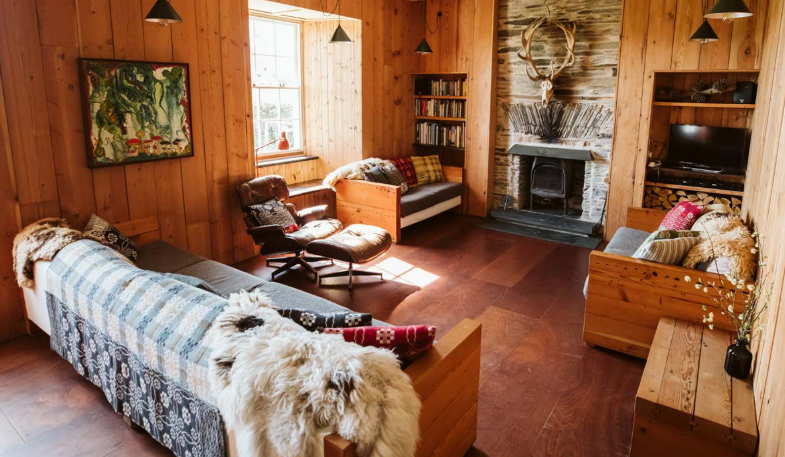
Ceredigion, Mid Wales