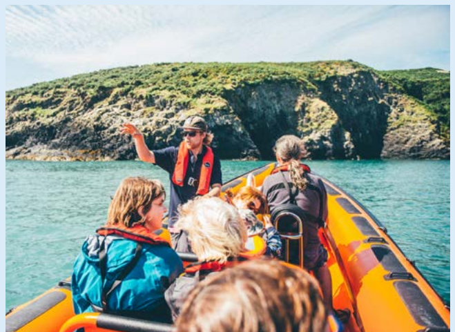
Dolphin Spotting, Ramsey Island Boat Trips, Pembrokeshire