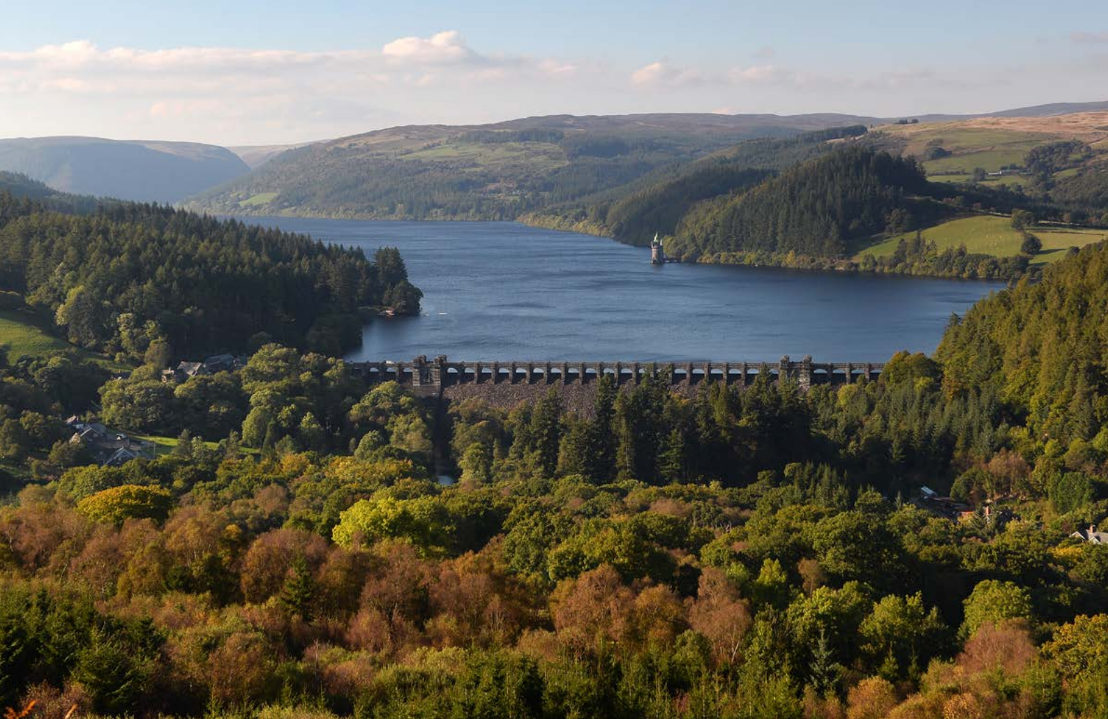
Lake Vyrnwy, Glyndwr's Way