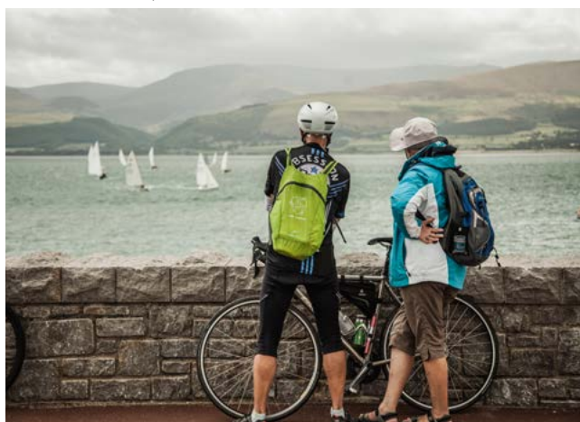
Wales Coast Path, Beaumaris, Anglesey