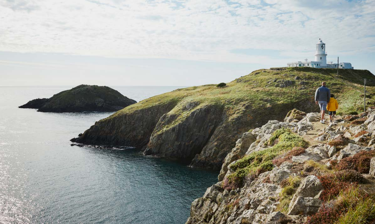
Strumble Head Lighthouse, Pembrokeshire