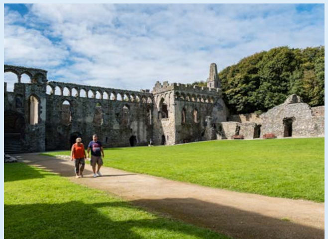
St Davids, Pembrokeshire

Saundersfoot, Hotels, Campsites, Restaurants & Caravan Parks