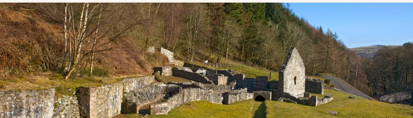
Bryntail Lead Mine Buildings

Sitting in the shadow of the dam at the southern end of the Reservoir, Bryntail's buildings are a glimpse back to the 19th century when this tranquil spot was a bustling site for extracting and processing lead. It closed in 1884 but the remains that still stand include crushing houses, ore bins, roasting ovens, smithy and the mine manager's office.