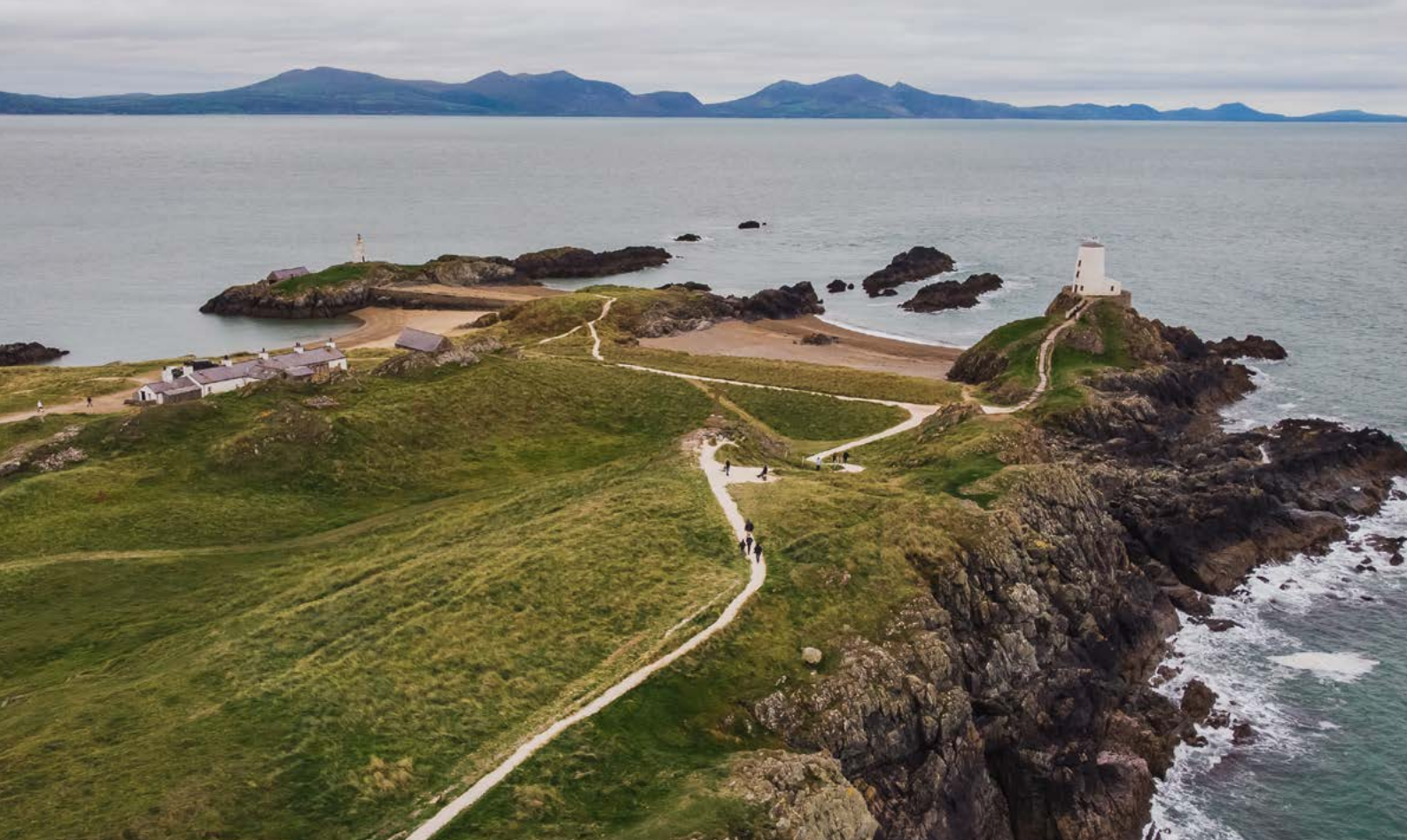
Llanddwyn Island, Anglesey