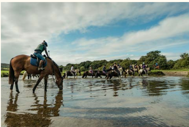
Ogmore-by-Sea, Ogmore, South Wales