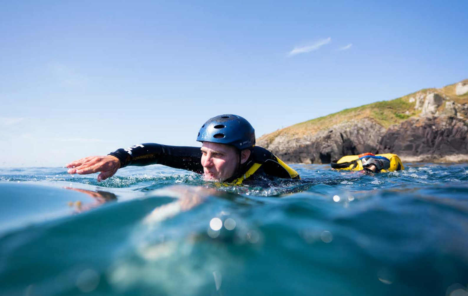
Porthclais Harbour, St Nons Bay, Pembrokeshire