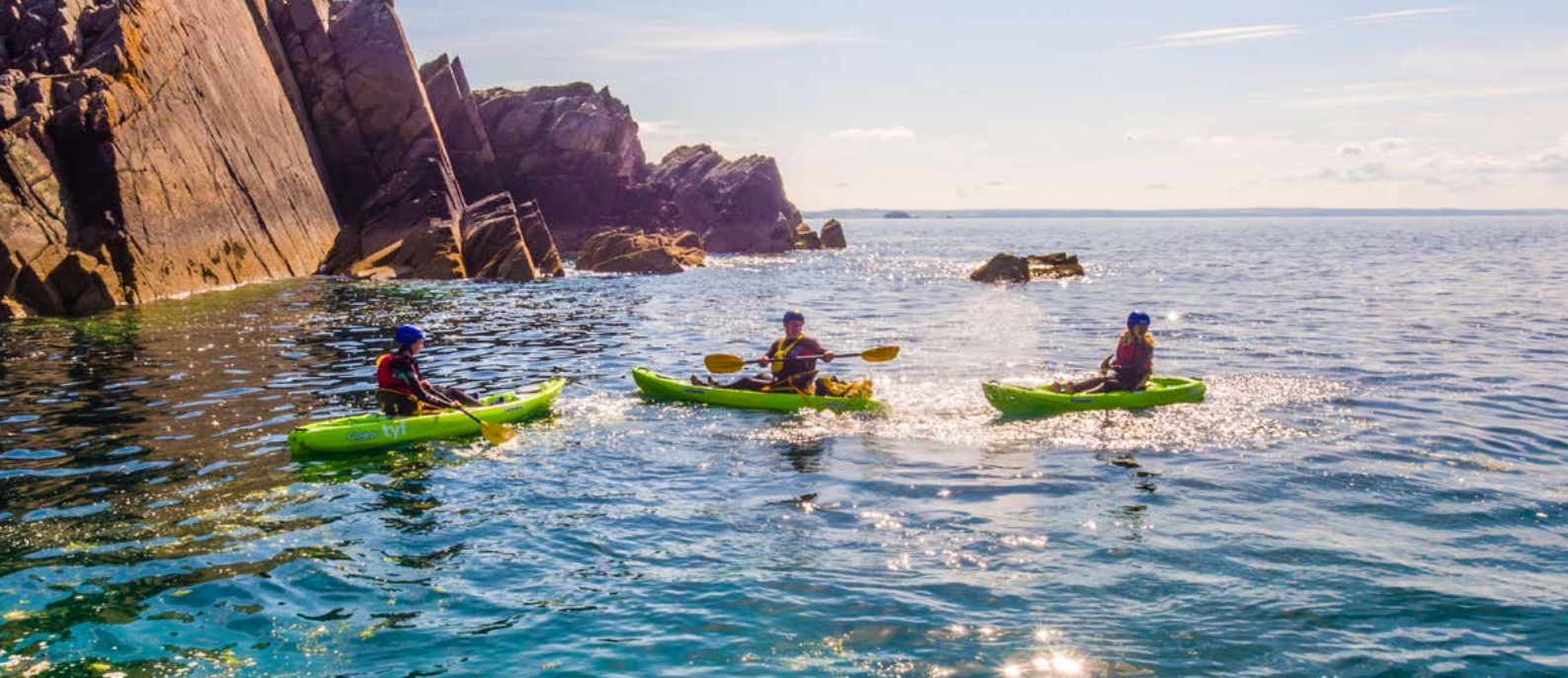
Kayakers, Porthclais Harbour, St Nons Bay, Pembrokeshire