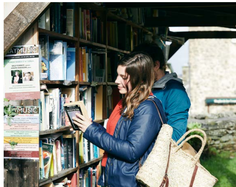
Hay on Wye, Powis

The links below showcase the best of retail in towns along the various routes to help you design a tour which offers your customers the maximum R&R to break up their day's walking.