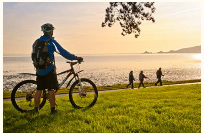
Cycling on Coast Path at Blackpill, Mumbles