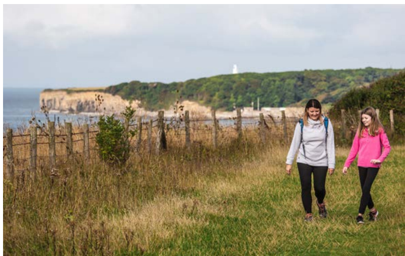
Llantwit Major, South Wales