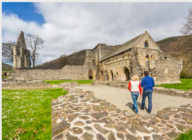
Valle Crucis Abbey, Denbighshire