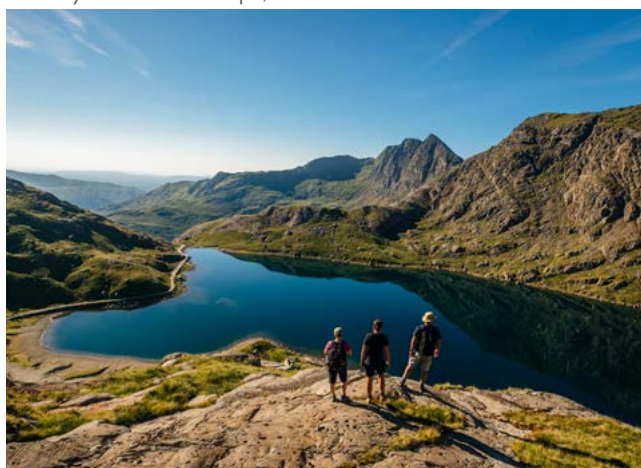
Snowdon, Snowdonia National Park