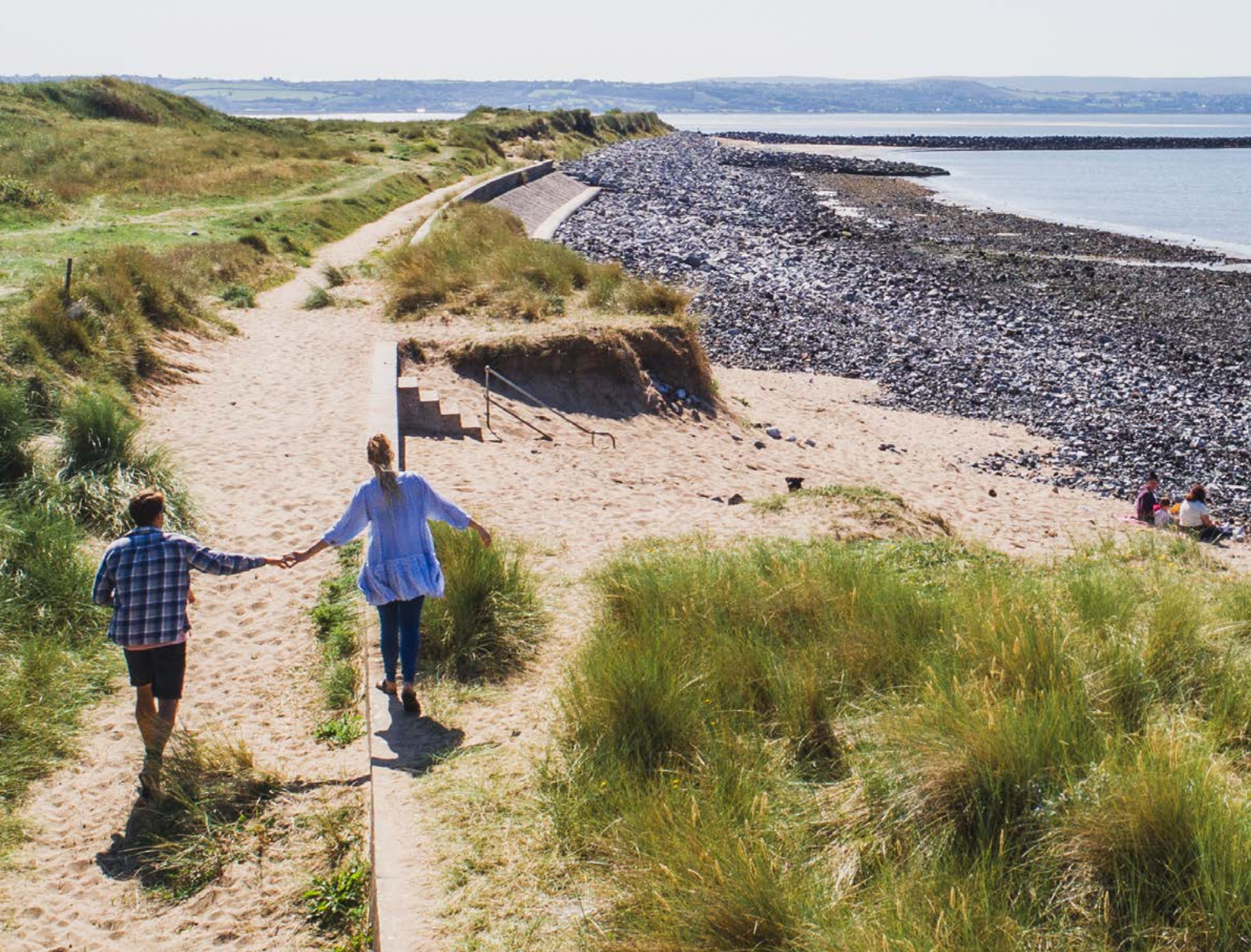
Millennium Coast Path, Llanelli