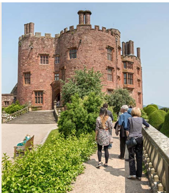
Powis Castle Garden, Welshpool