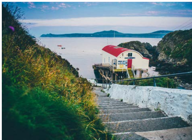
Ramsay Island Boat Trips, Pembrokeshire