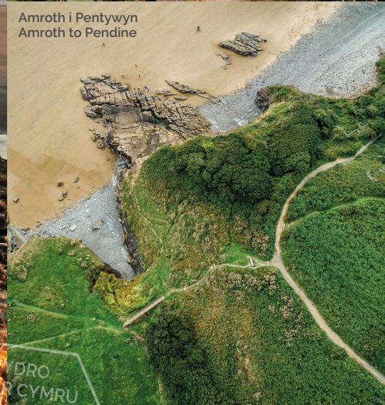
Amroth i Pentywyn Amroth to Pendine