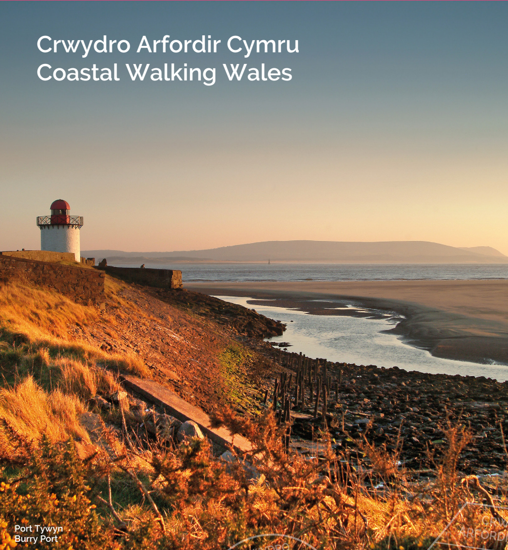
Port Tywyn Burry Port